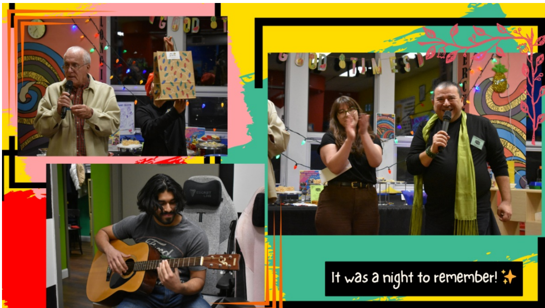
It was a night to remember! ✨