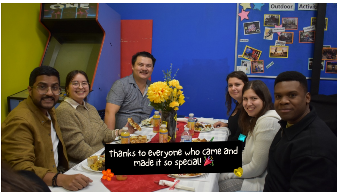
Thanks to everyone who came and made it so special!