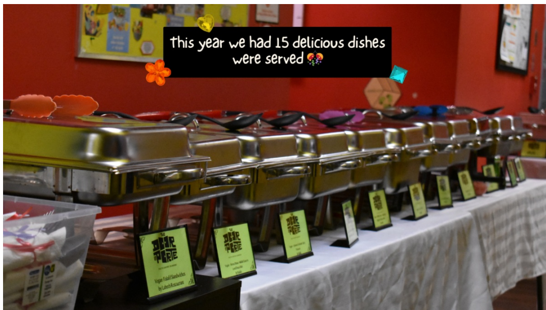
This year we had 15 delicious dishes were served 🍷