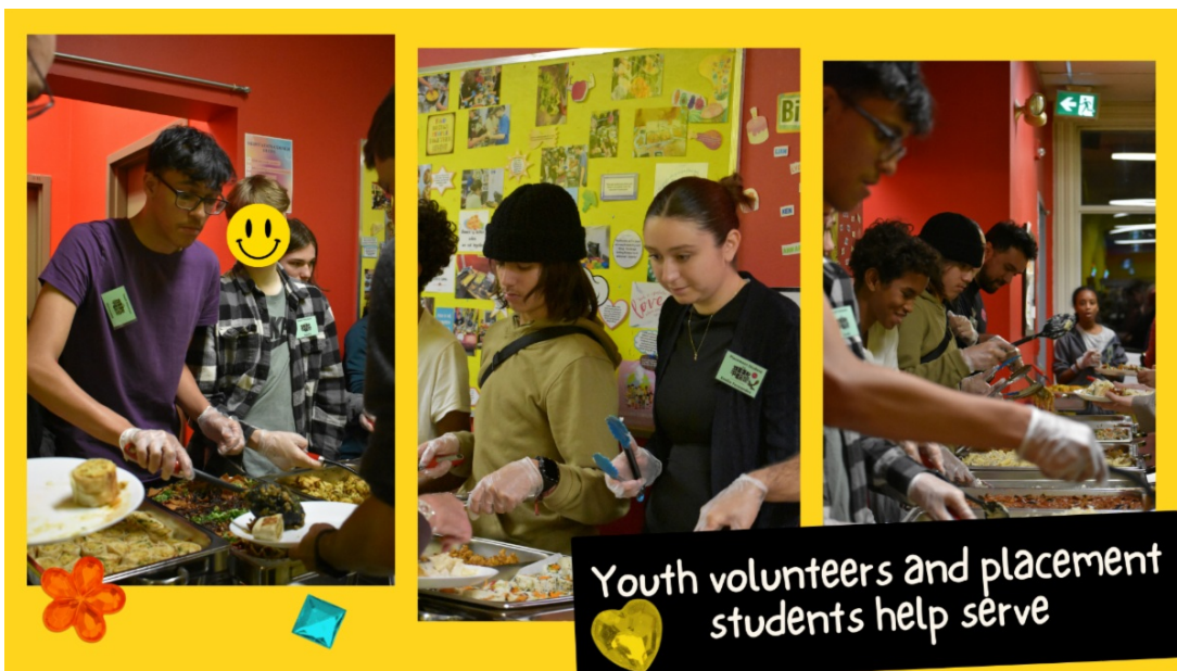
Youth volunteers and placement students help serve