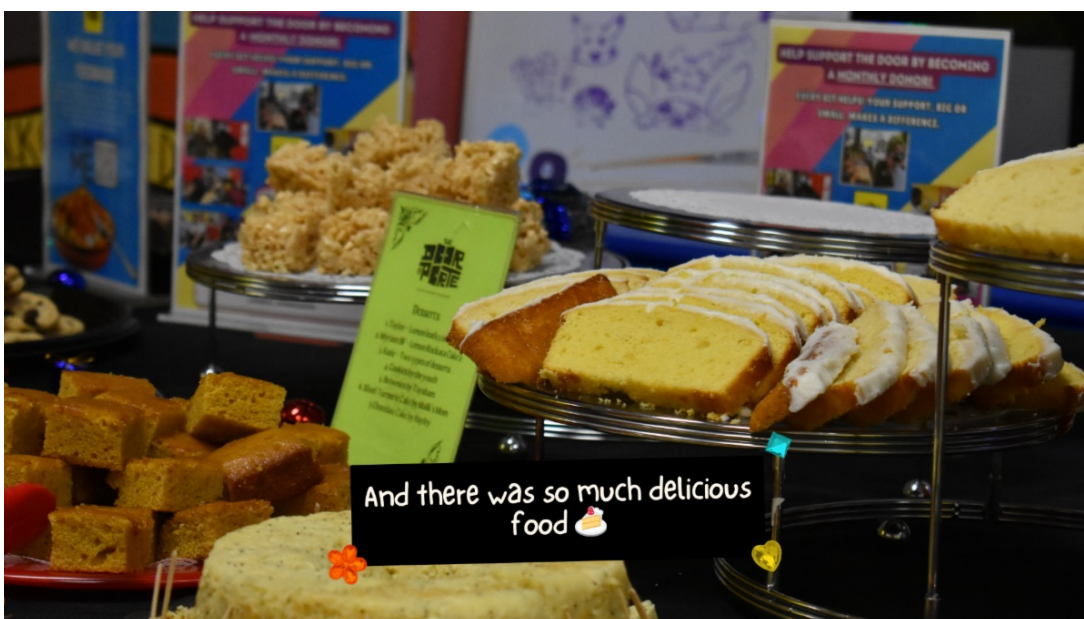
And there was so much delicious food 🍰